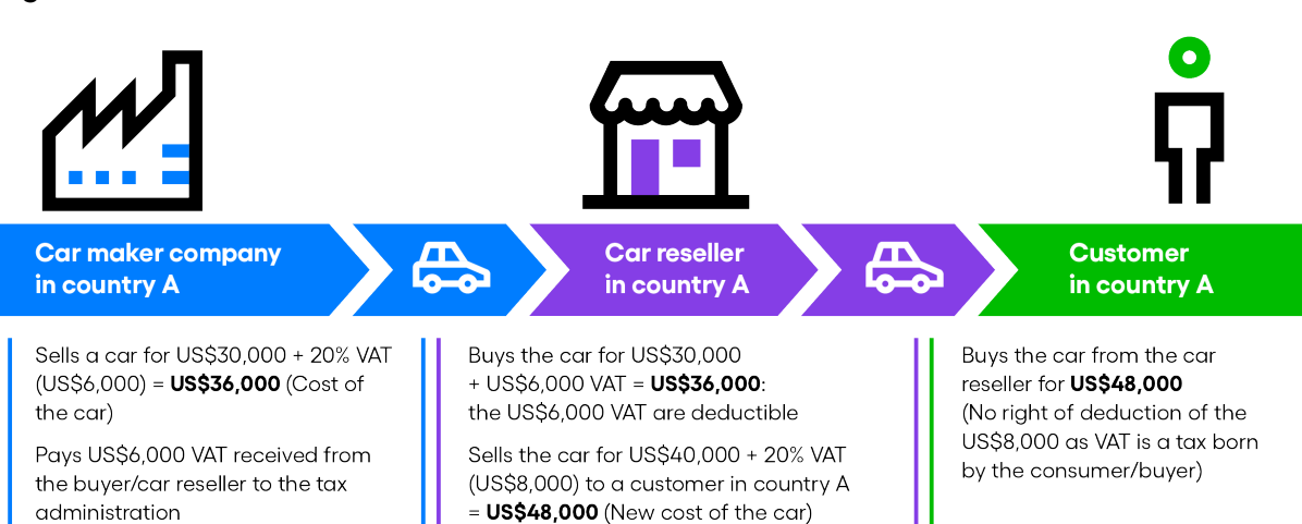
Figure 1. VAT in a domestic situation